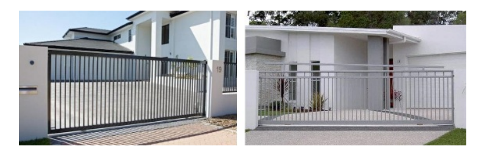
4 x 1m Nylon Covered Steel Gear Rack for Sliding Slide Gate