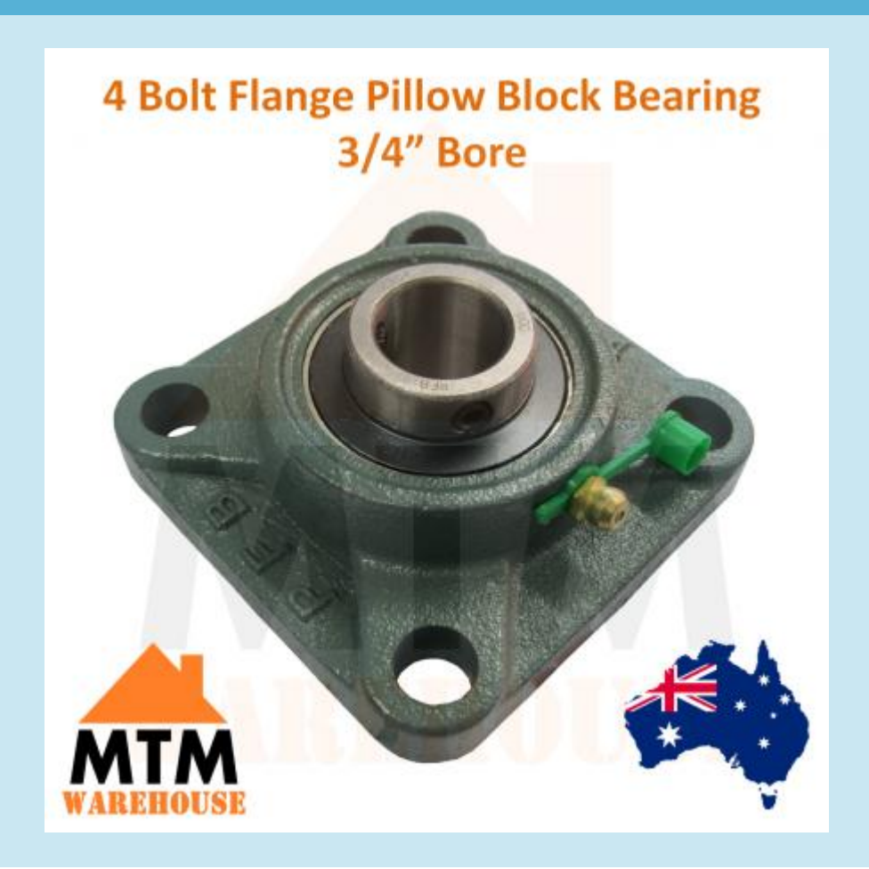
4 Bolt Flange Pillow Block Bearing

The bearings consist of a self-aligning feature, so it allows the bearings' inner ring and outer ring to have a specific angle. Pillow block bearings are widely used in machinery systems such as, pharmaceutical, food, printing machines, motorcycles, motors, pumps, fans, air conditioners and many more.