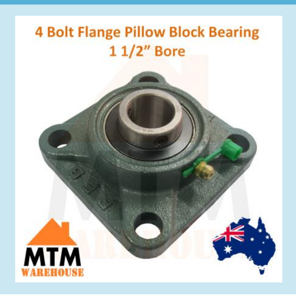
4 Bolt Flange Pillow Block Bearing

The bearings consist of a self-aligning feature, so it allows the bearings' inner ring and outer ring to have a specific angle. Pillow block bearings are widely used in machinery systems such as, pharmaceutical, food, printing machines, motorcycles, motors, pumps, fans, air conditioners and many more.