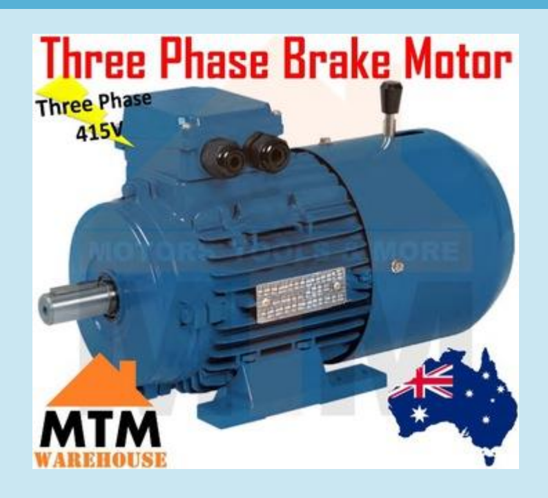
3kW 4HP 1400rpm 4 Pole Three Phase Brake Motor