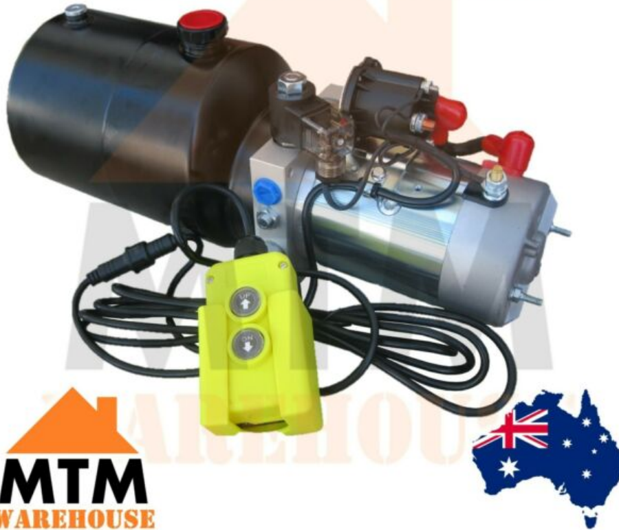
24V DC Hydraulic Power Pack Power Unit for Tipper or Tail Gate