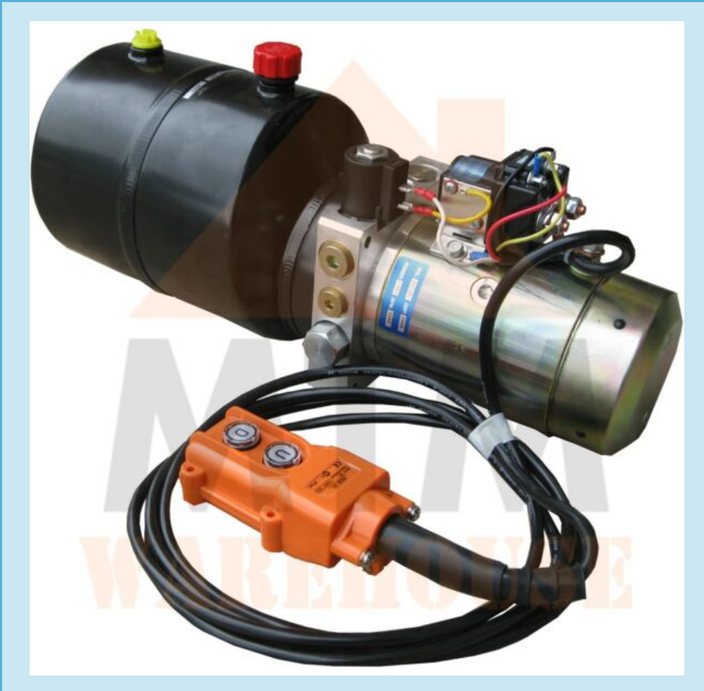
24V DC Hydraulic Power Pack Power Unit for Tipper or Tail Gate 10L