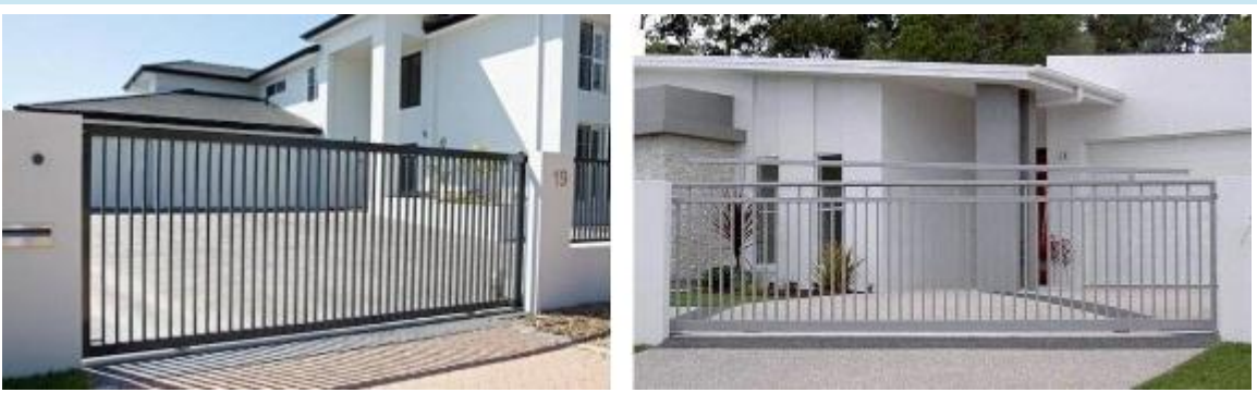
1m U-Groove Steel Track for Sliding Slide Gate