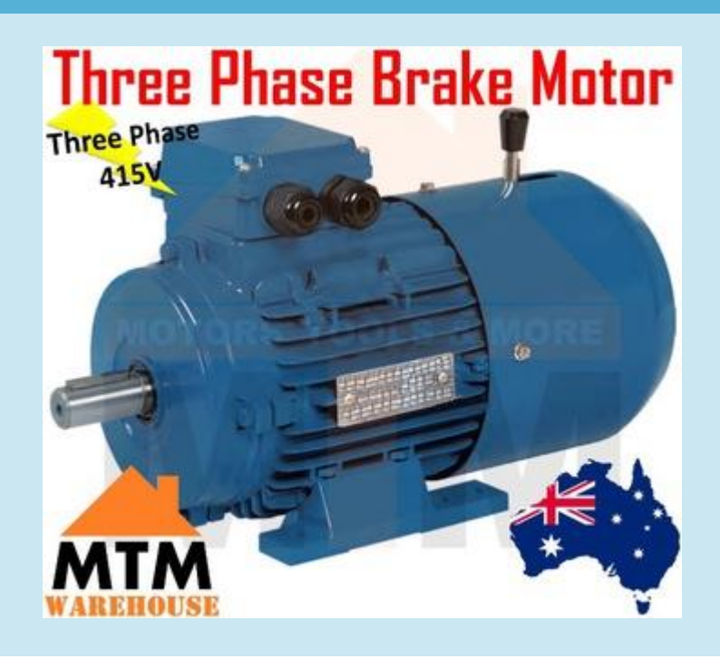
1.5kW 2HP 1400rpm 4 Pole Three Phase Brake Motor

Three Phase Brake Motor 1.5Kw 2HP 1400rpm