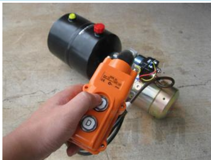
12V DC Hydraulic Power Pack Power Unit for Tipper or Tail Gate