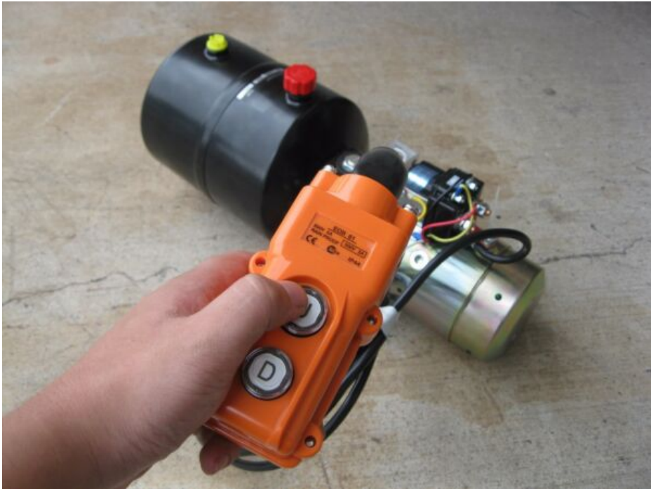
12V DC Hydraulic Power Pack Power Unit for Tipper or Tail Gate 8L Tank