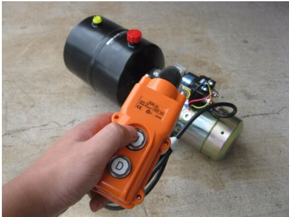
12V DC Hydraulic Power Pack Power Unit for Tipper or Tail Gate 10L Tank