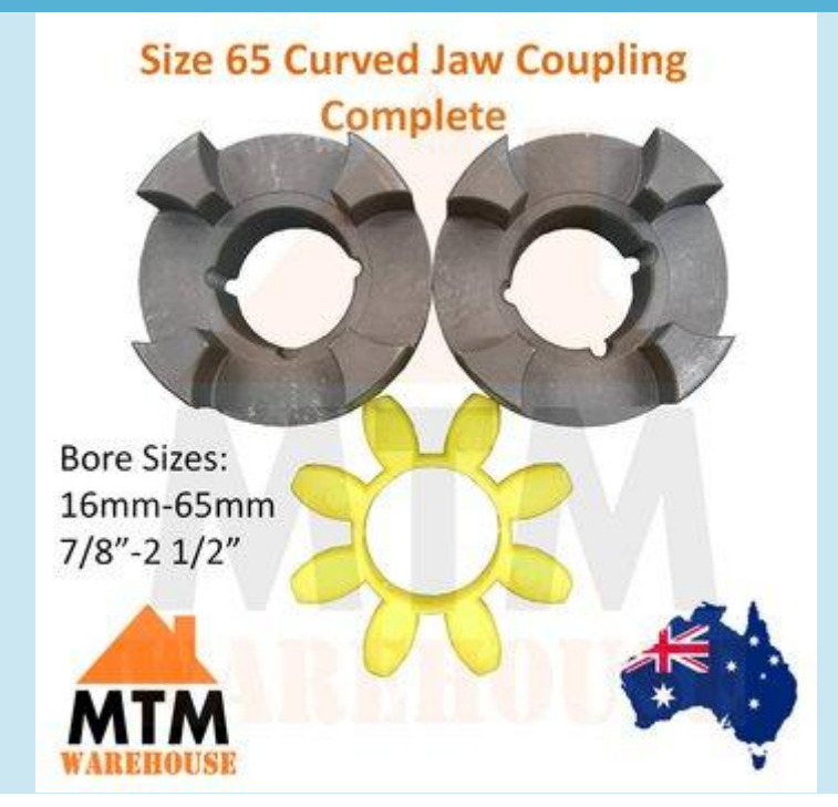
Size 65 Curved Jaw Coupling

Please select Bore Sizes below and message desired sizes upon checkout