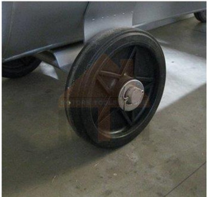
High Efficiency IE3 Motor