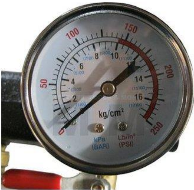
Easy to Reach on/off Button on the Air Compressor