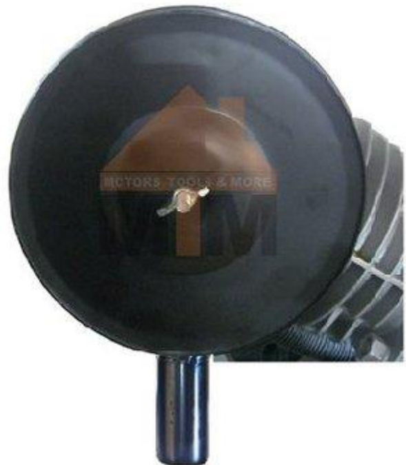
Double Belt Air Compressor