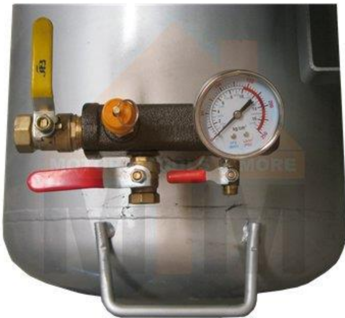
High Pressure Tank Going upto 12.5 Bar