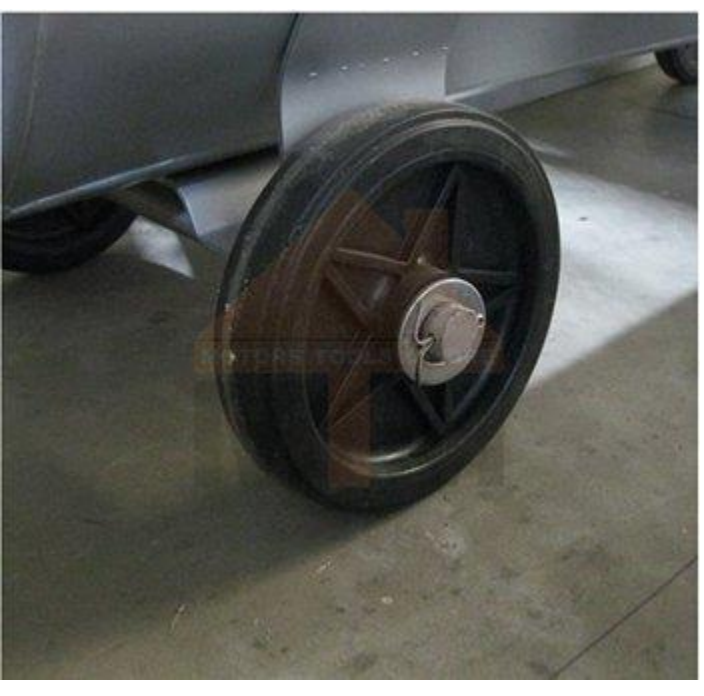
High Efficiency IE3 Motor