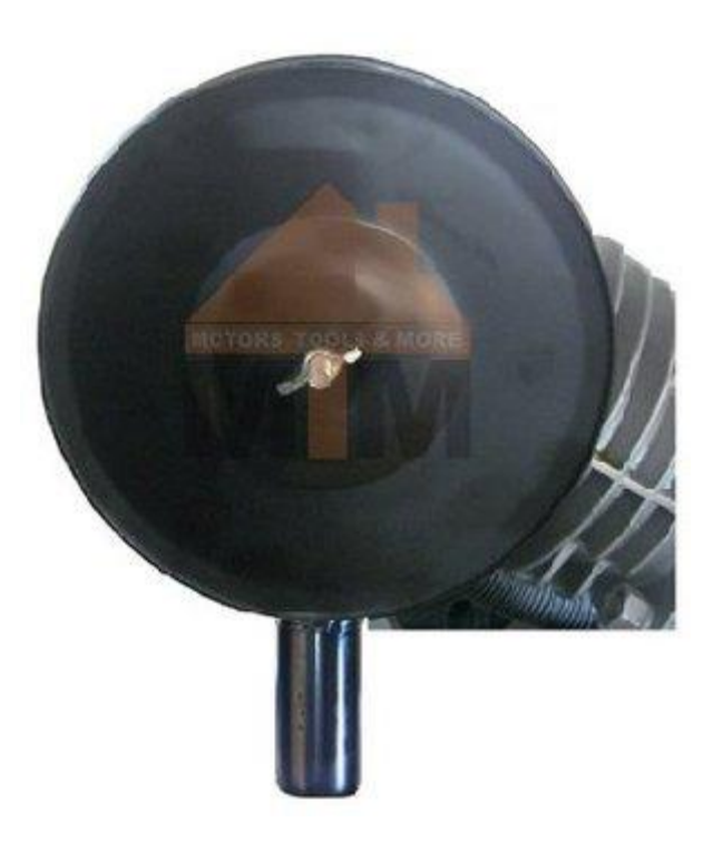
Double Belt Air Compressor