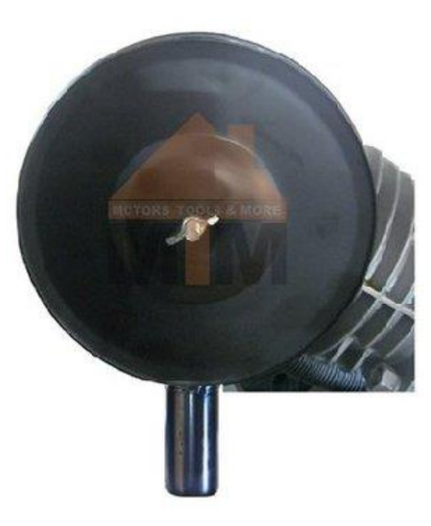
Double Belt Air Compressor