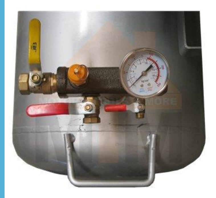
High Pressure Tank Going up to 8 Bar